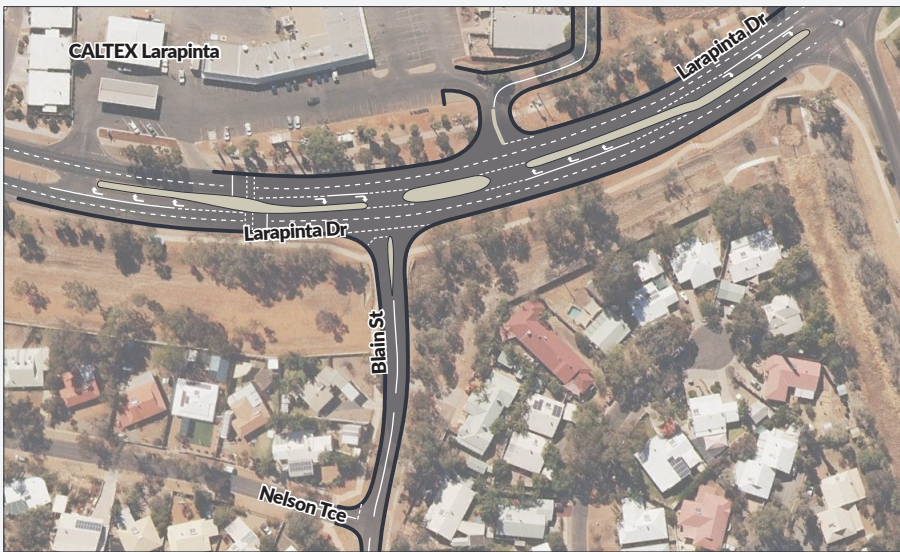
Figure 1: Current intersection alignment

There are significant traffic hazards and delays at these intersections from vehicle and pedestrian traffic around the Araluen Christian College and the Diarama Village Shops.