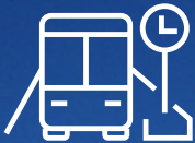
Bus stop connections