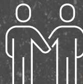
Face to face meetings

Across all four locations, 36 meetings were held and more than 800 surveys and map responses were received. Various consultation methods were used during both stages to ensure a range of opportunities for people to be involved in the process. The methods included: