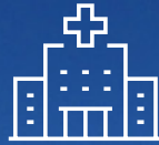
Links to existing education, health, tourism or commercial land uses