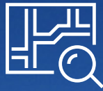
Identified on existing plans or programs