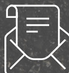
Hard copy surveys